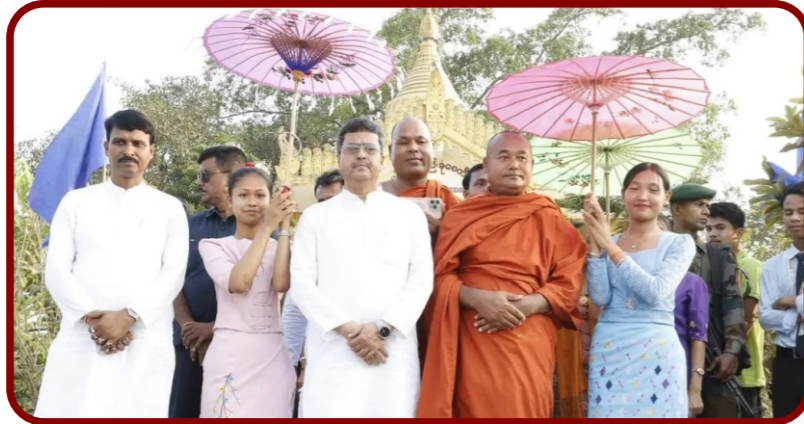
Visit of Shri Dr. Manik Saha Hon'ble Chief Minister, Govt. of Tripura