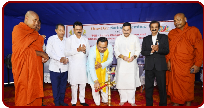
Visit of Shri Kishor Barman Hon'ble Higher Education Minister, Govt. of Tripura