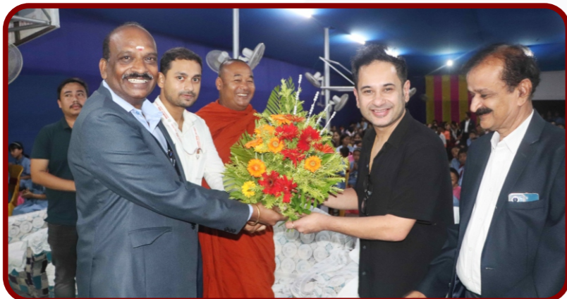
Visit of Shri Pradyot Kishore Manikya Deb Barma Hon'ble Tripura Maharaja